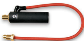
195377 50 mm Dinse-style with water return line for water-cooled torch.