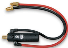
195380 50 mm Dinse-style gas thru with gas and water return lines for water-cooled torch.