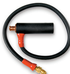
225028 50 mm thread-lock-style for water-cooled torch.