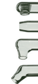
Optional nozzles are available (see page 3)