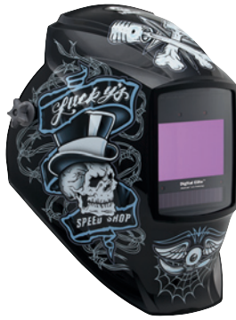
Lucky's Speed Shop™ 281001