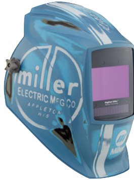
Vintage Roadster™ 281004