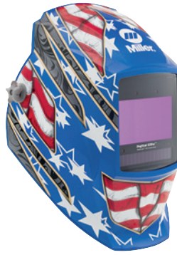
Stars and Stripes™ III 281002