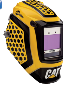
CAT® Cat® Edition 1 281006